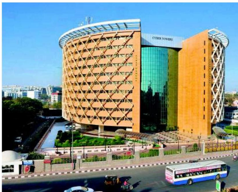
PROMOTING ENTREPRENEURSHIP Hyderabad possesses all the ingredients that contributed to the making of Silicon Valley, believes the government. A general view of the Cyber Towers at HITECH City in Hyderabad; (below) A view of the T-Hub in Gachibowli.

Initially, 50 start-ups will occupy the space, and by November, 50 more will get in. By December, the facility will be fully occupied and functional. It will house a good mix of start-ups catering to various fields, according to Mr. Krishnan. The city, which is witnessing a start-up boom of late, is waiting for the launch of T-Hub, evident from the over 400 applications